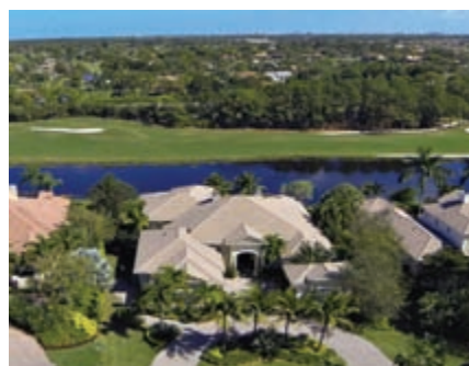
OLD MARSH GOLF CLUB | $2.35M