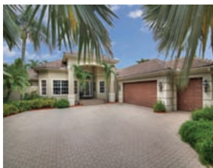
BREAKERS WEST | $1.225M