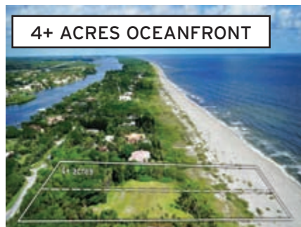
4+ ACRES OCEANFRONT